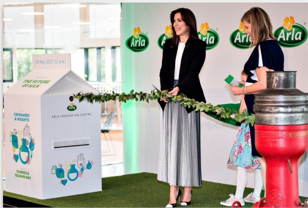
HRH Crown Princess Mary of Denmark (left) opening the Arla Global Innovation Centre